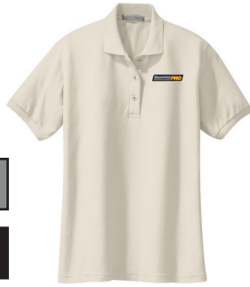
A Men's Solid Polo $26.00