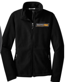
I Women's Full Zip Fleece $31.00