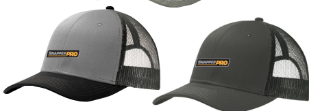
J Adult Mesh Back Trucker Hat $11.00

Colors: Heather Gray/white Gusty Gray/Black/Steel Gray, Gray Steel