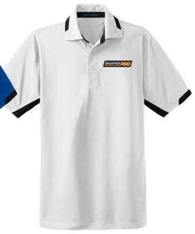
C Men's Ottoman Color Block Polo $30.00

Colors: Black/Gray, Royal/Black, White/Black