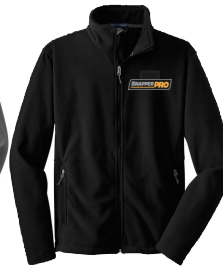
H Adult Full Zip Fleece $31.00