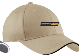
K Adult Sandwich Structured Hat $10.00