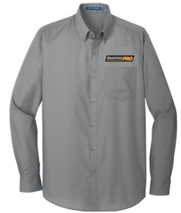
F Men's Longsleeve Carefree Poplin $26.00