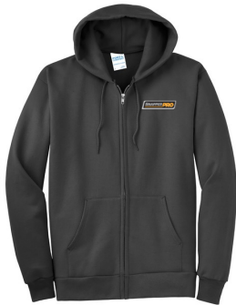
G Adult Full Zip Hooded Sweatshirt $29.00