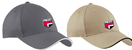
K Adult Sandwich Structured Hat $10.00 Colors: Charcoal/White, Stone/Black