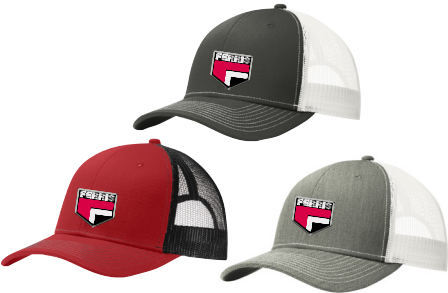
J Adult Mesh Back Trucker Hat $11.00 Colors: Gray Steel/White, Red/Black, , Heather Gray/White